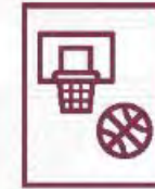
Half Basketball Court