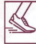
Jogging/ Bicycle Track