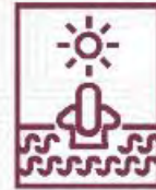
Infinity-edged Swimming Pool